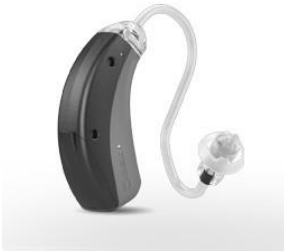
M (Micro BTE)